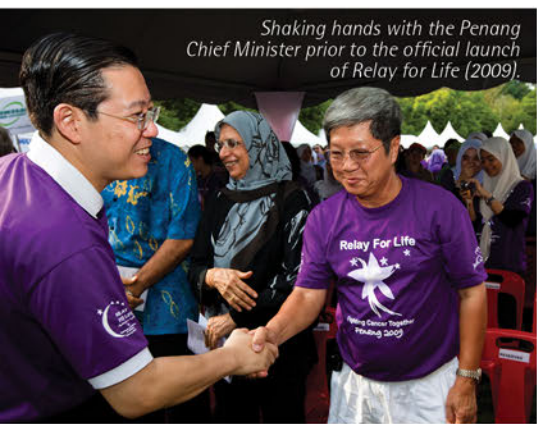
Shaking hands with the Penang Chief Minister prior to the official launch of Relay for Life (2009).