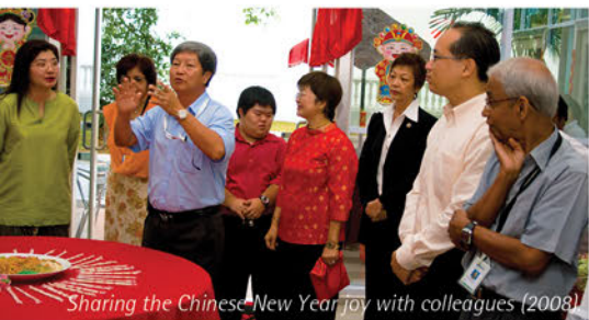
Sharing the Chinese New Year joy with colleagues (2008)