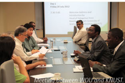
Meeting between WOU and KNUST.