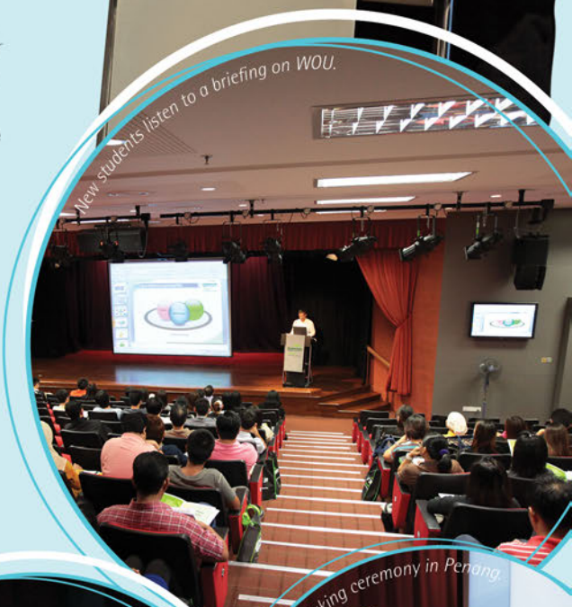
New students listen to a briefing on WOU.