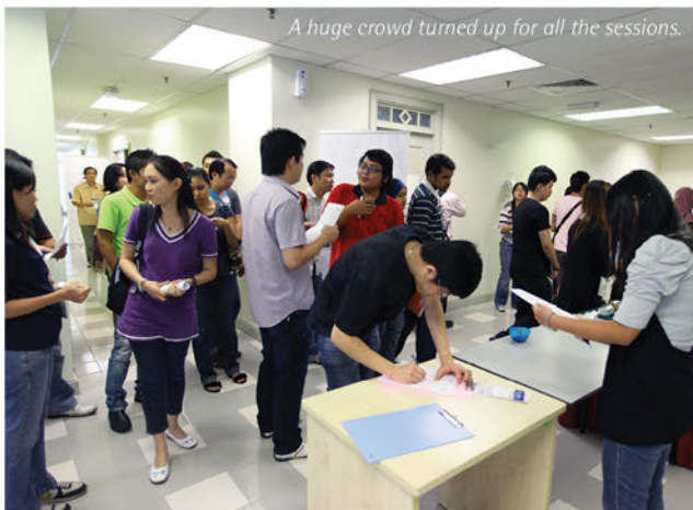
A huge crowd turned up for all the sessions.