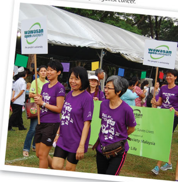
Walking in support of the fight against cancer.