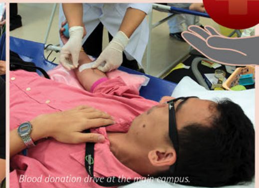
Blood donation drive at the main campus.