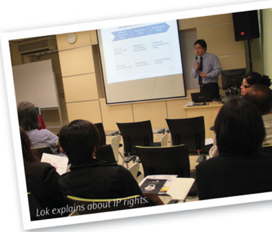
Lok explains about IP rights.

During the Q&A, Lok highlighted that it takes 3-4 years for patent to be granted in Malaysia and each patent filed may cost RM10,000 but it's still worth the investment.