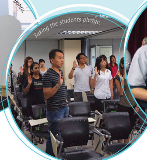
Taking the students pledge.