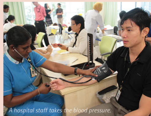
A hospital staff takes the blood pressure.