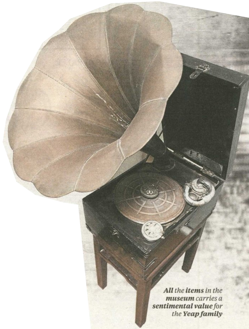
All the items in the museum carries a sentimental value for the Yeap family